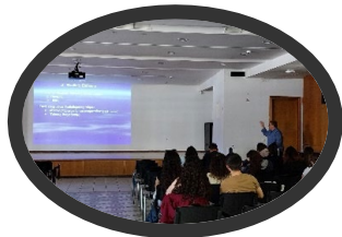
Dissemination to undergraduate students