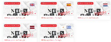
A course on fake news is available in five languages.